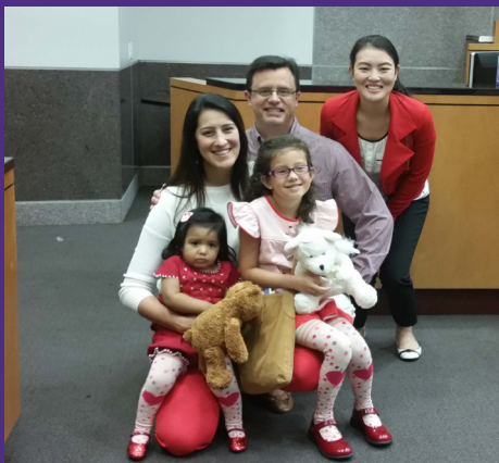
The D Family with caseworker Dee