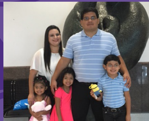
The Cordova Family