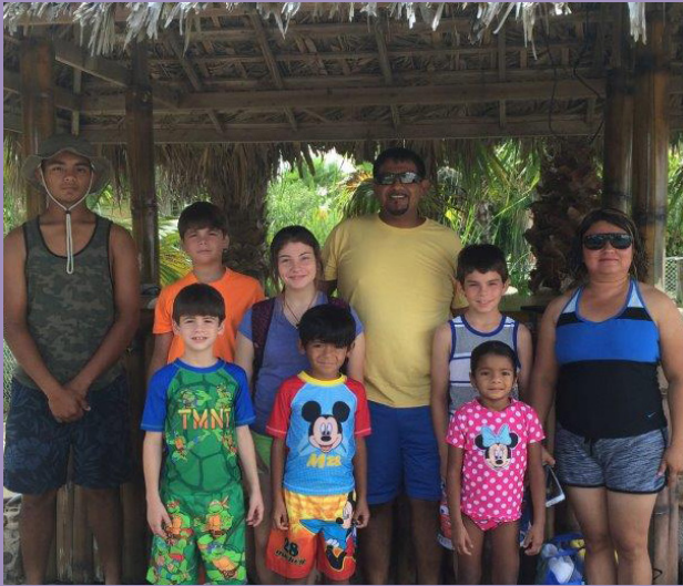
The Beltran family enjoying Spaulding for Children's day at Schlitterbahn, South Padre Island!