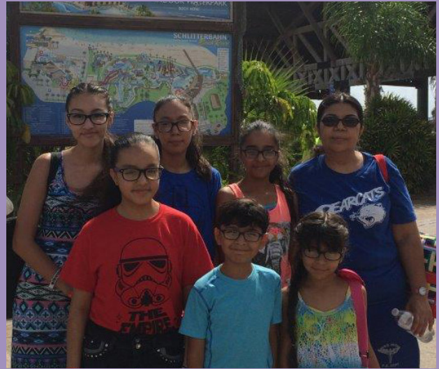
The Cruz family enjoying Spaulding for Children's day at Schlitterbahn, South Padre Island!