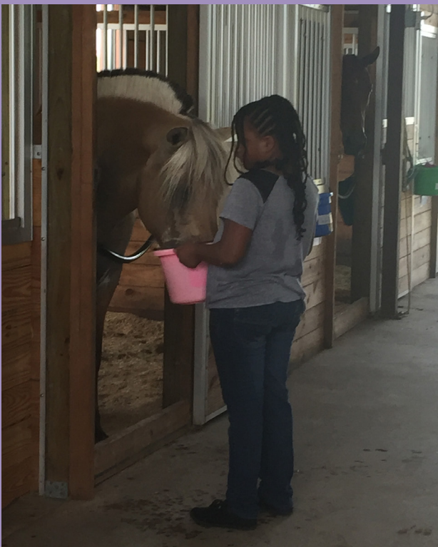
Our Fort Bend Post Adoption families had an outing at Reining Strength Therapeutic Horsemanship this summer!

Reining Strength provides therapeutic horsemanship programs for people of all ages - children and adults - who have physical, cognitive, social, or emotional needs.