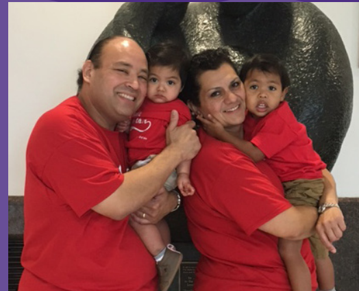
The Serrano Family