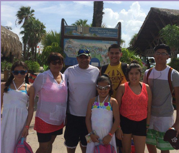
The Ayar family enjoying Spaulding for Children's day at Schlitterbahn, South Padre Island!