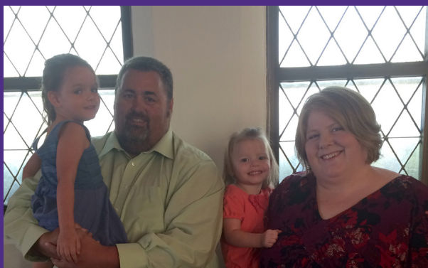
The Fontenot Family