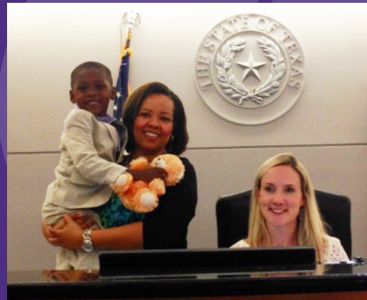
The Tidwell Family