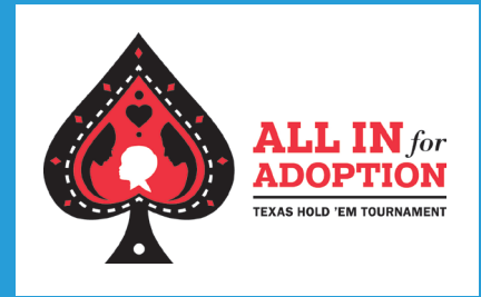
Learn more about this event at armswide.org/all-in-for-adoption