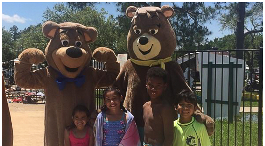
Our kids definitely had fun at the waterpark inside Yogi Bear's Jellystone Park