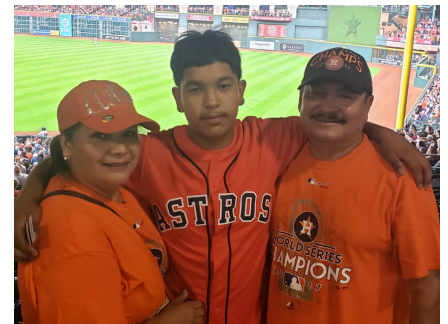
Post Adoption families were also invited to enjoy a Houston Astros game on "dollar dog night"