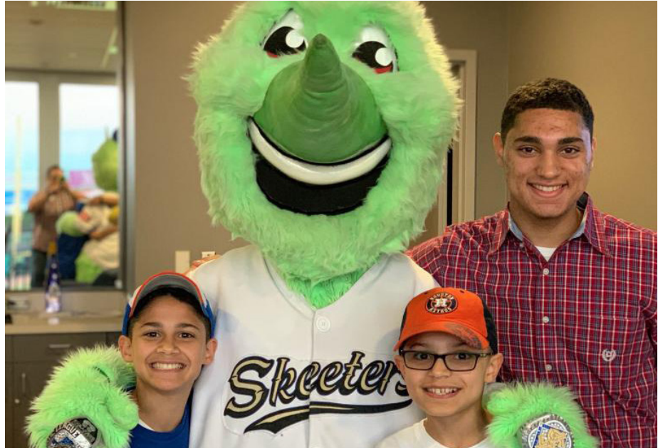
Our Post Adoption families enjoying a Sugar Land Skeeters game

Arms Wide Adoption Services had an eventful summer with our kids and families. We hosted so many fun activities through our Post Adoption Program!