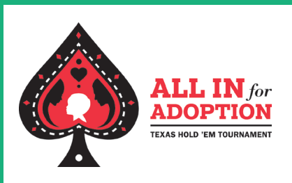
Learn more about this event at armswide.org/all-in-for-adoption