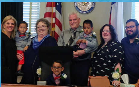
The Arnold Family February 2020

Over the last 43 years, Arms Wide Adoption Services has placed more than 2,100 children with their forever families. Meet a few of the newest Arms Wide Adoption Services families below: