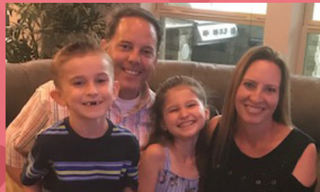
The Hodes Family September 2020