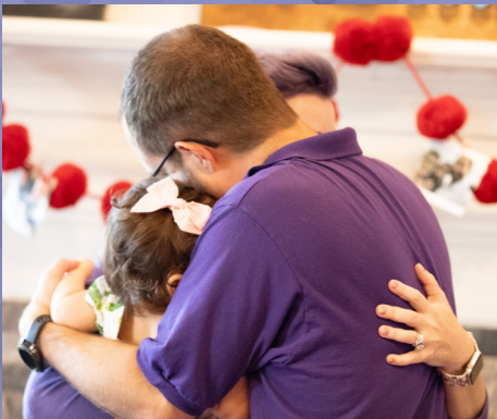
That precious moment when you're finally forever

Thanks to your support, our work to transform the lives of children in foster care has not slowed down even as our organization adapted to these challenging times.