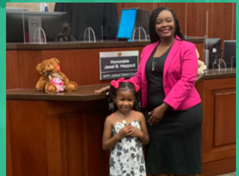
The Green Family April 2022