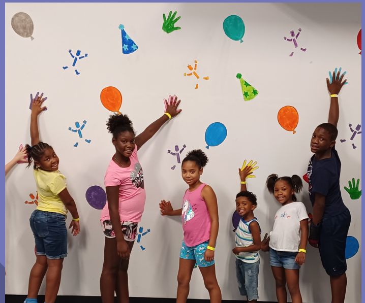
Children bounced around at Sugar Land's Trampoline Park while parents enjoyed a presentation about sensory processing.