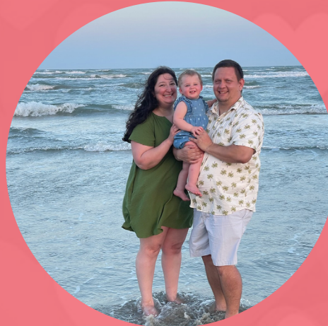
The Floyd Family