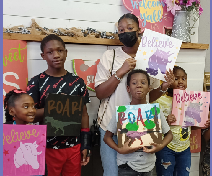
Families enjoyed painting together at The Rustic Brush while hearing a presentation about internet safety by Crime Stoppers.