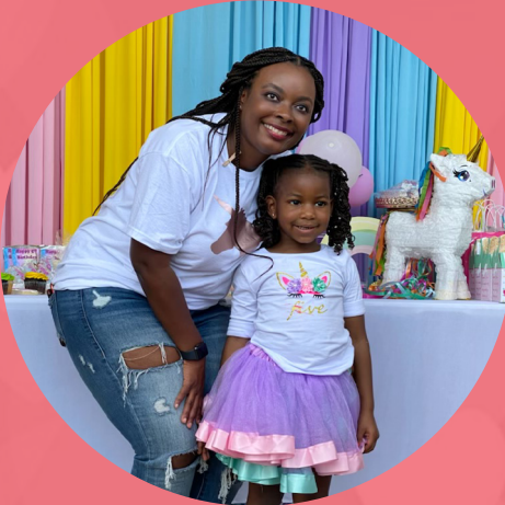
The Green Family

November is National Adoption Month , so it is the perfect time to celebrate these families fulfilled. Meet a few of the newest Arms Wide families: