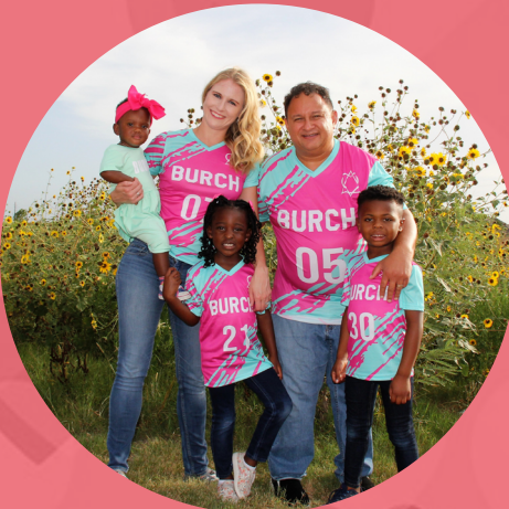
The Burch Family