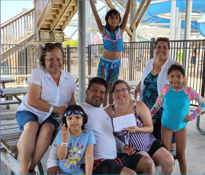
In South Texas, families enjoyed a day of fun in the sun at Hurricane Harbor while parents joined a workshop about child development and behavior.

Arms Wide Adoption Services' vision is for all children to be loved within a home and all families to feel supported. Post adoption programs and guardianship support can be important in helping children overcome past trauma and in giving families tools to thrive. This summer, we had a great time with families pairing parent training opportunities with fun in the sun, artistic expression, and jumping around at the trampoline park!