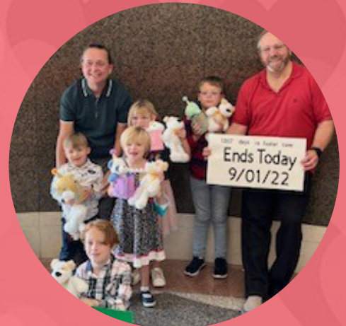
The Peoples-Castlow Family