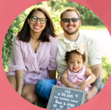
The Fontenot Family