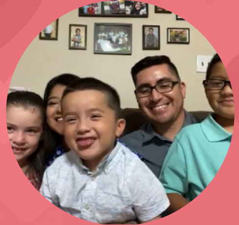
The Gutierrez Family