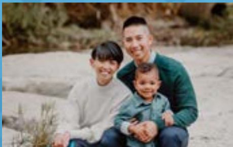
The Phan Family November 2022

Over the last 46 years, Arms Wide has matched more than 2,280 children with their forever families. Meet a few of the newest Arms Wide families below: