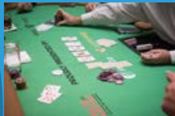
Each game played supports Arms Wide's mission of transforming lives of children in need