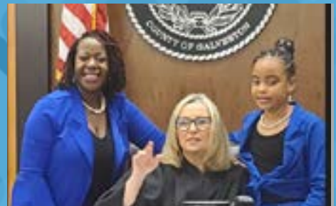
The Bolling Family May 2023