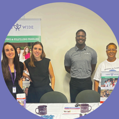
Relatives As Parents Conference