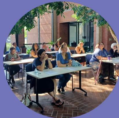
Free Spa Day for Moms in our Permanency Support Program