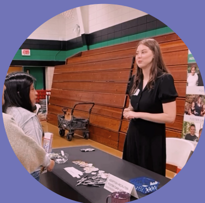
School Career Day

From community outreach to supporting our existing community of families, we meet those who need us most where they're at.