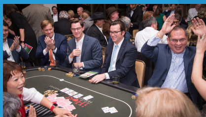
Each game played supports Arms Wide's mission of transforming lives of children in need of safe and nurturing permanent families.