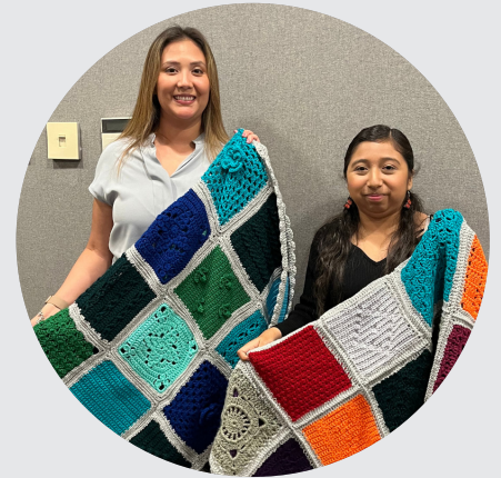
A local crochet group with Spring Branch-Memorial Library donated beautiful handmade blankets for children in our programs.