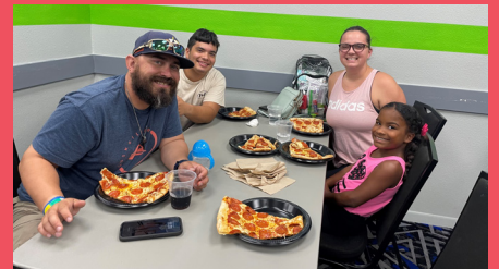
Families in the South Texas area were invited to a day at a go-kart racetrack (above) and a beach day (below), which both included workshops for parents and caregivers.