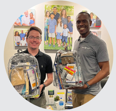
Ascend Performance Materials donated backpacks chock-full of brand new school supplies for children in our programs.