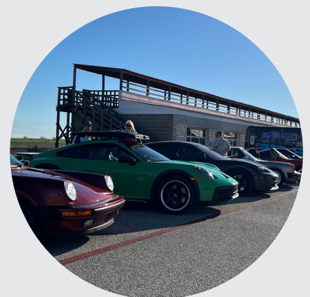
The 3rd Annual Drive for Kids was a thrilling success that benefitted Arms Wide and Child Advocates.