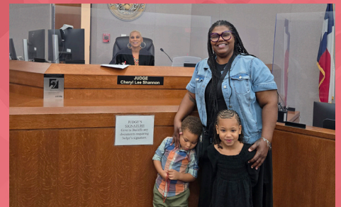
The Bowers Family September 2024