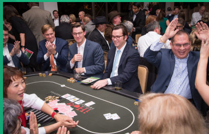
Each game played supports Arms Wide’s mission of transforming lives of children in need of safe and nurturing permanent families.