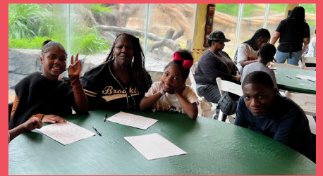
Families in the Greater Houston area were invited to events at the Sugar Land Space Cowboys (top left and top middle), Houston Zoo (top right), Sloomoo Institute, and more!